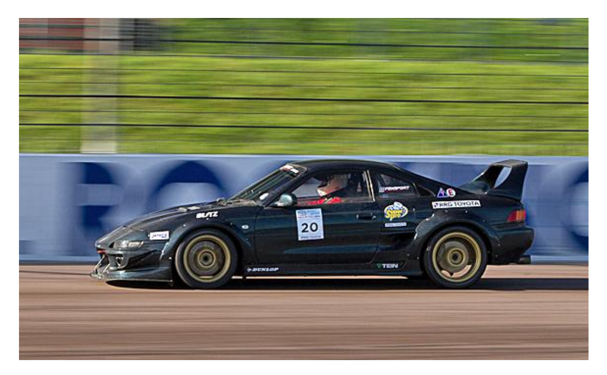
Luke Lawrence MR2 Turbo, Rockingham