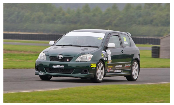
Ollie Novel Corolla, Croft