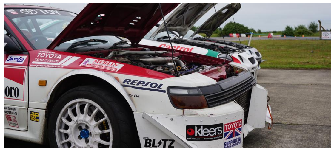
Celica's line up for scrutineering