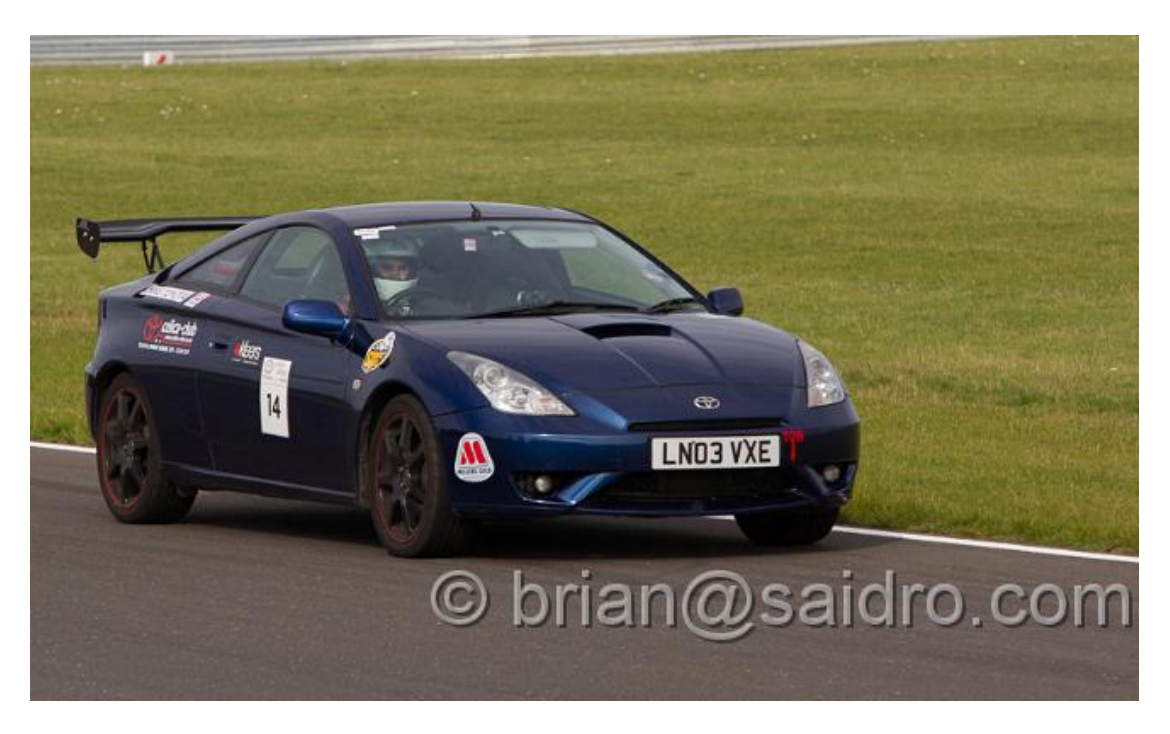
Class A3 Pro - Over 1.6 Forced Induction

Joe Tapply (above) all on his own in class A3 Pro but still trying hard and recording a 1:47.89 for the class win.