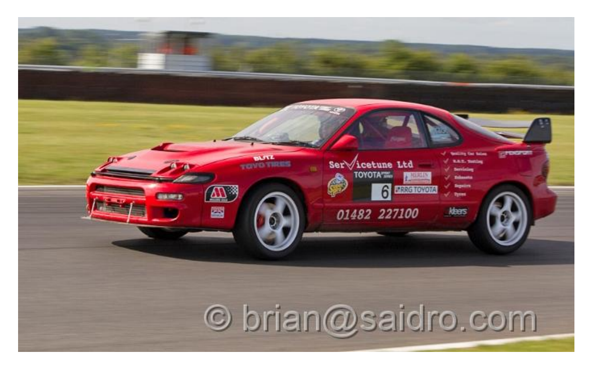
Class A1 Pro - Over 1.6 Forced Induction

Joe Tapply (above) all on his own in class A3 Pro but still trying hard and recording a 1:47.89 for the class win.