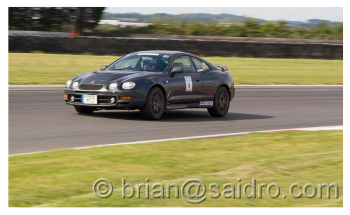
Class A3 Street - Over 1.6 Forced Induction

Barrie Newsome was back with a vengeance and a new gearbox! But it was series regular Phil Cutler who took the early lead and was in front up until run 3 when Barrie stole the lead by a few tenths and continued to go faster and record a 1:43.50 to secure the class win from Phil in his MR2 supercharger.