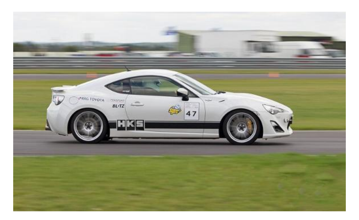
Class F2 - Forced Induction - Street

Four cars competing in N2, and it was Stan Hawrylak (above) who set the pace straight away and continued to get even faster throughout the day, setting an incredible 1:43.29 on run 8, to take not only the class win but also claim 4th overall! Paul Thomas took 2nd in class.