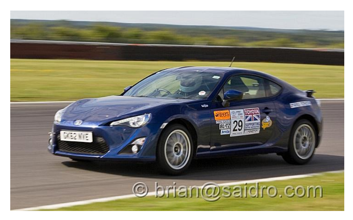
Class N2 - Normally Aspirated - Modified - Street

The brand new GT86 & BRZ sprint series is growing within the TSS championship.. Split in to different classes depending on modifications keeps the competition close. 9 competitors took to the track for the fourth round.